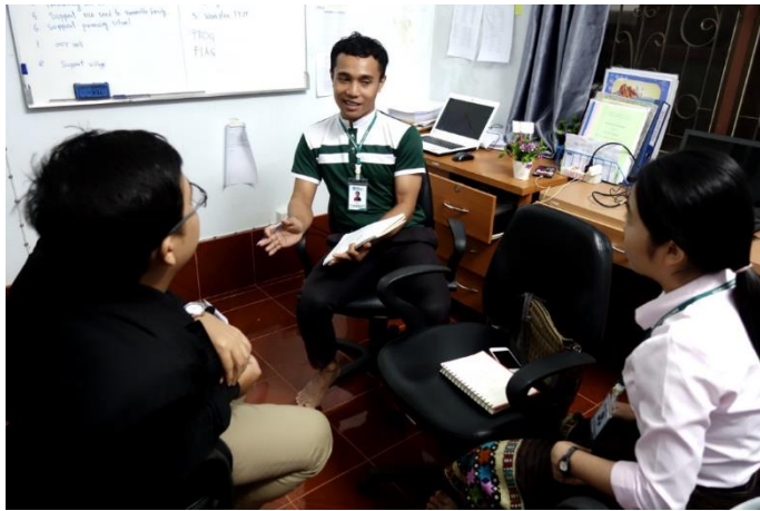
(Left) Small group discussion

A team of seven WCL staff specializing in aspects of community development and support services (e.g. project proposal writing) spent three days learning about lifelong action learning, the GULL system and how to integrate GULL with WCL's work. This team will work towards their GULL Professional Bachelor degree over the next 12 months by integrating GULL with the WCL initiative 'One village transformed'. By mapping the key transformational outcomes expected by WCL with GULL's Certificate and Diploma awards, it will be possible to cascade GULL to community participants who will earn points (based on the step by step attainment of WCL outcomes). Those who gather sufficient points will earn their GULL Certificate in September 2020 and those who exceed the requirement, a Diploma.